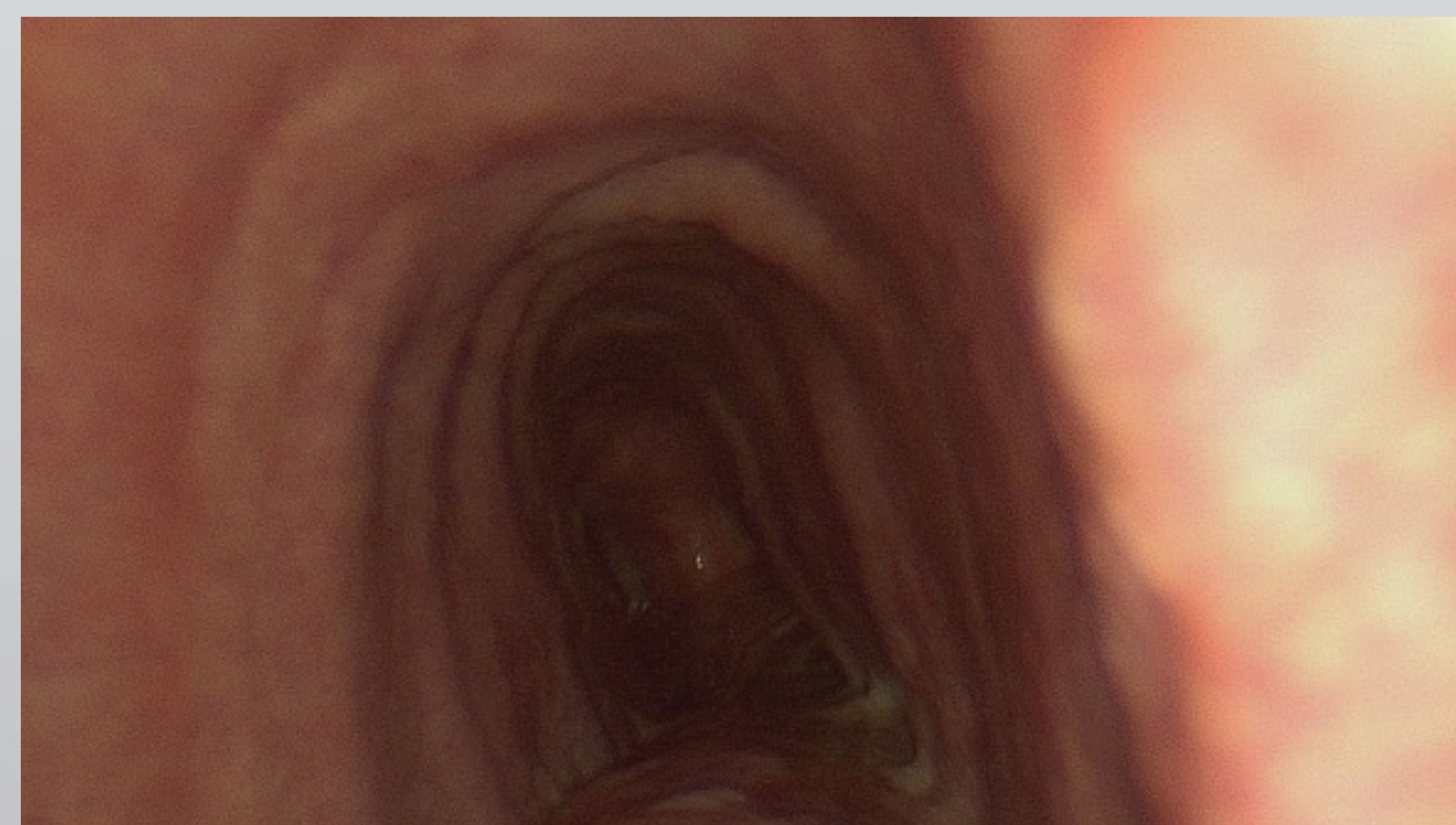
Figure 3: Return to expanded state during inspiration.