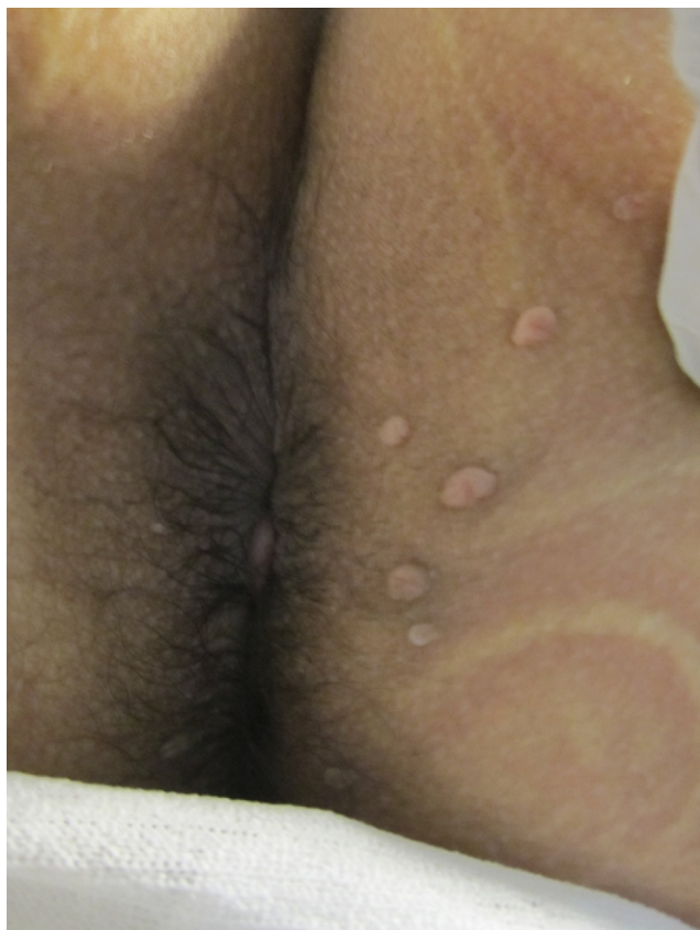
Figure 1 Anal warts on postpartum patient. Warts became prominent during pregnancy, a common phenomenon.

ing warts by biopsy and viral assays are not recommended unless the lesion looks suspicious. 3-6 Genital warts usually appear as flat, pedunculated, or papular lesions (Figs. 1 and 2). 7 They may develop anywhere in the squamous epithelium of the lower genital tract and cervix. 5,7 Patients may present to their primary care physician with complaints of discharge, pruritus, bleeding, or burning related to underlying genital warts. 5 The differential diagnoses for genital warts include, but are not limited to, pearly penile papules, Fordyce spots, squamous cell carcinoma, condyloma lata, molluscum contagiosum, microglandular papillomatosis, hymenal remnants, seborrheic keratoses, and fibroepitheliomas. 3-7 Any lesion that looks suspicious should be biopsied. Specifically, lesions that are large, pigmented, or develop in an immunosuppressed patient deserve special attention. 5,8 If these conditions exist, vulvar intraepithelial neoplasia (VIN) or warty vulvar cancers must be excluded.