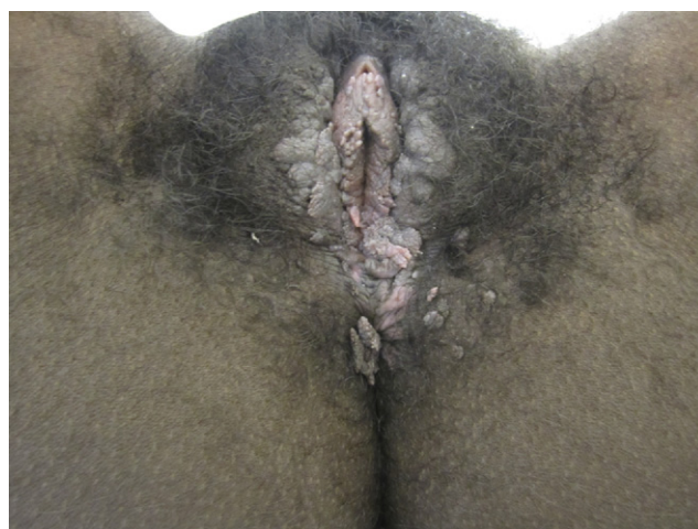
Figure 2 Anogenital warts over perineum, labia majora, and labia minora.

Cervical lesions that may be related to HPV are detected on pap screening during well-woman examinations. It should be noted that although the association between oncogenic genital HPV infection and cervical intraepithelial neoplasias and cervical cancer is strong, there are other risk factors that lead to progression in cervical lesions, such as smoking, heredity, and immune deficiency. 10,12 Cytological screening with pap testing serves as a triage assessment to separate lesions that are likely to have a higher risk of progression to cancer from lower-risk lesions, specifically as it relates to certain patient populations. In general, because of the high rate of HPV infection and high rate of spontaneous clearance of HPV infections and related lesions in young women (age <21 years), lower-grade cytologic findings of low-grade squamous intraepithelial lesion